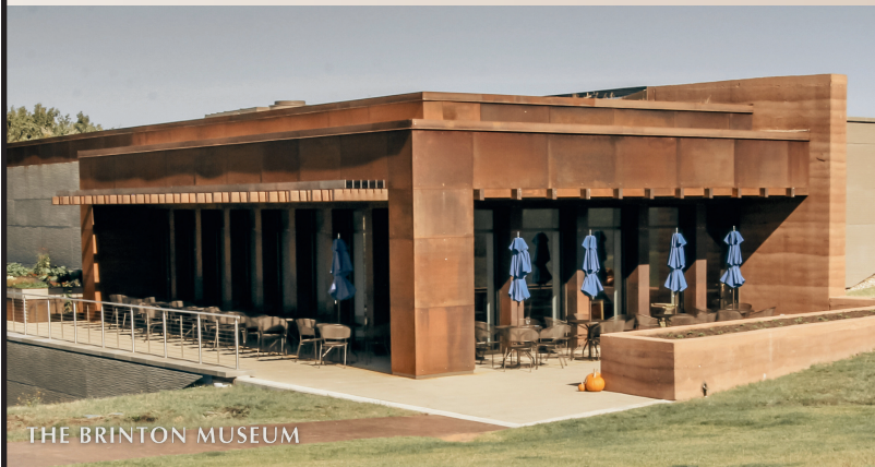
THE BRINTON MUSEUM