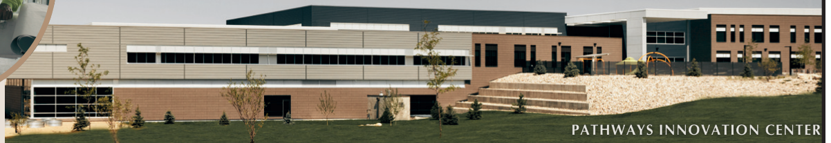
PATHWAYS INNOVATION CENTER